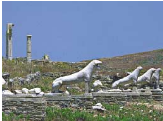
The Lions of Delos

The most famous of these nearby islands is Delos. There you can explore the best preserved ancient city in Greece, the birthplace of Apollon and Artemis.