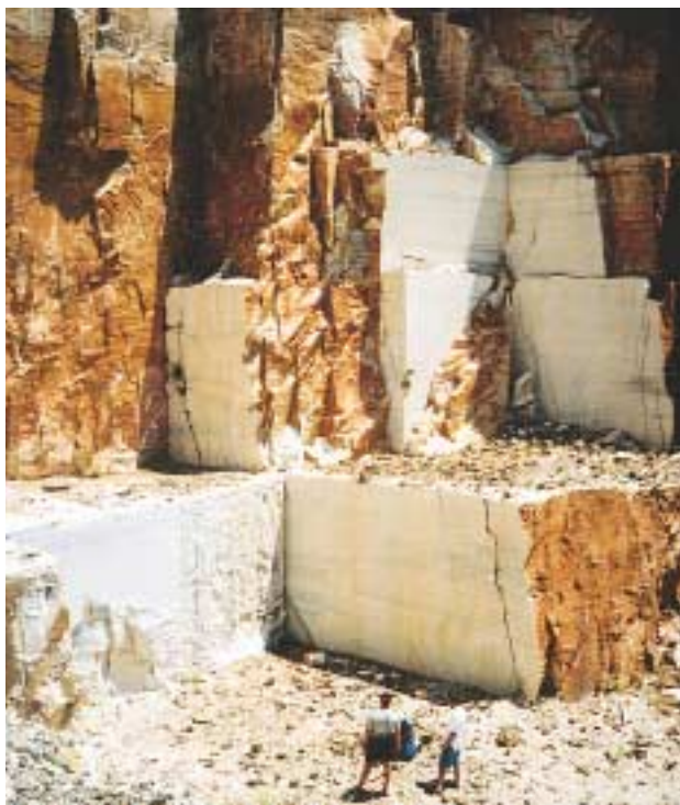
Quarry of Vathi