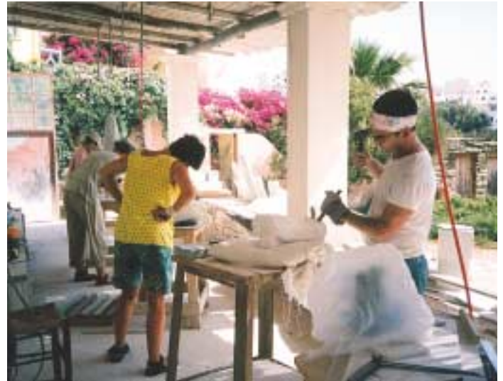
Outdoor work area at the studio

The studio works from 9:00 a.m. until 2:00 p.m., Monday through Saturday. Sculptors may return in the evenings for two additional hours of unassisted work from 5:30 to 7:30, Monday through Friday.