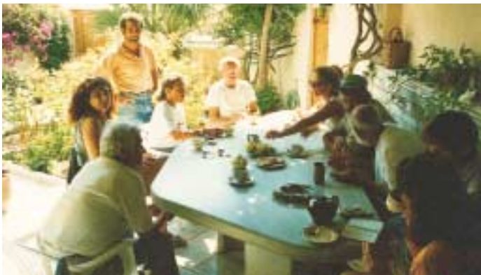
Mid-morning coffee breaks in the lush garden give the artists an opportunity to relax and exchange ideas.

The studio welcomes artists from May through October and encourages them to work for no less than two weeks.